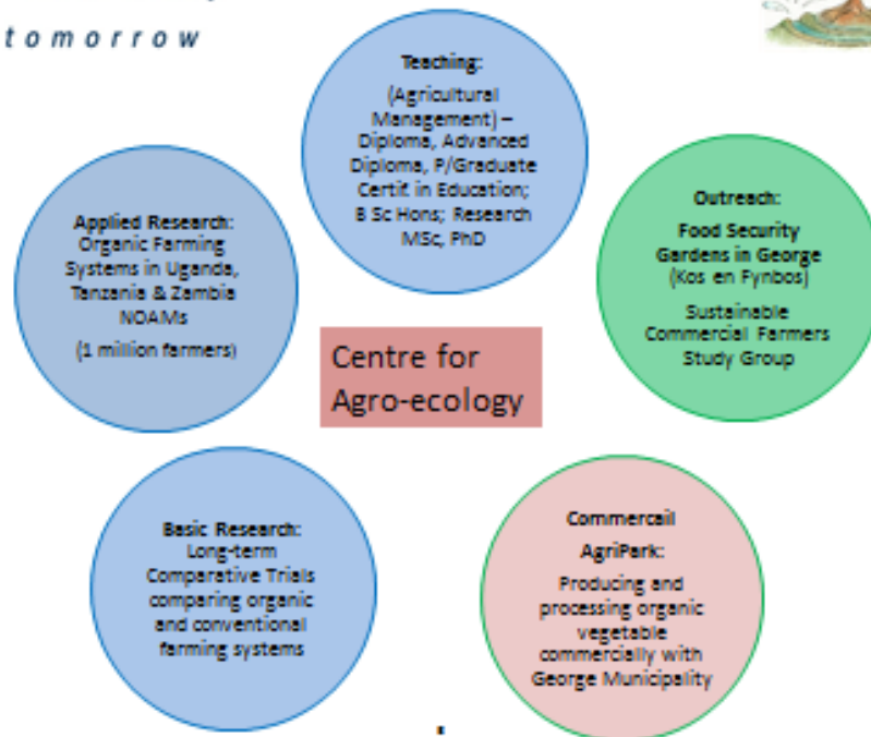
Figure 1: Concept for the Collaborative Centre for Agro-ecology

The CoE FS contributes to food security at household level and improves access to food nationally and regionally, using a trans-disciplinary approach to food production research. The work on the NMMU George Campus is integrated with Public Health and Value Chain projects at UCT, with nutrition and health projects, and with consumer choice projects. Partnerships are at the heart of this research programme. The proposed Collaborative Centre for Agro-ecology (see Figure 1) is a vehicle or building such trans-disciplinary work, both at NMMU and with other institutions.