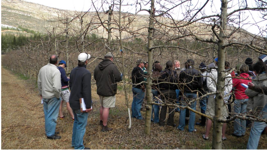
NMMU students visit local commercial orchards to learn about Integrated Pest Management