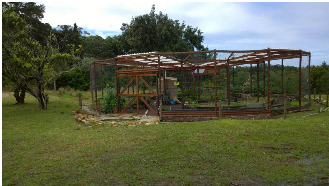
Figure 2: The baboon-proof Permaculture Garden (PG) on the George Campus of NMMU

The research site represents an area where basic farming systems research will take place. It is closely linked to three post-graduate research projects in Uganda and Zambia, where three doctoral candidates are looking at applied research into training, support, marketing and governance of agro-ecology in southern and eastern Africa.