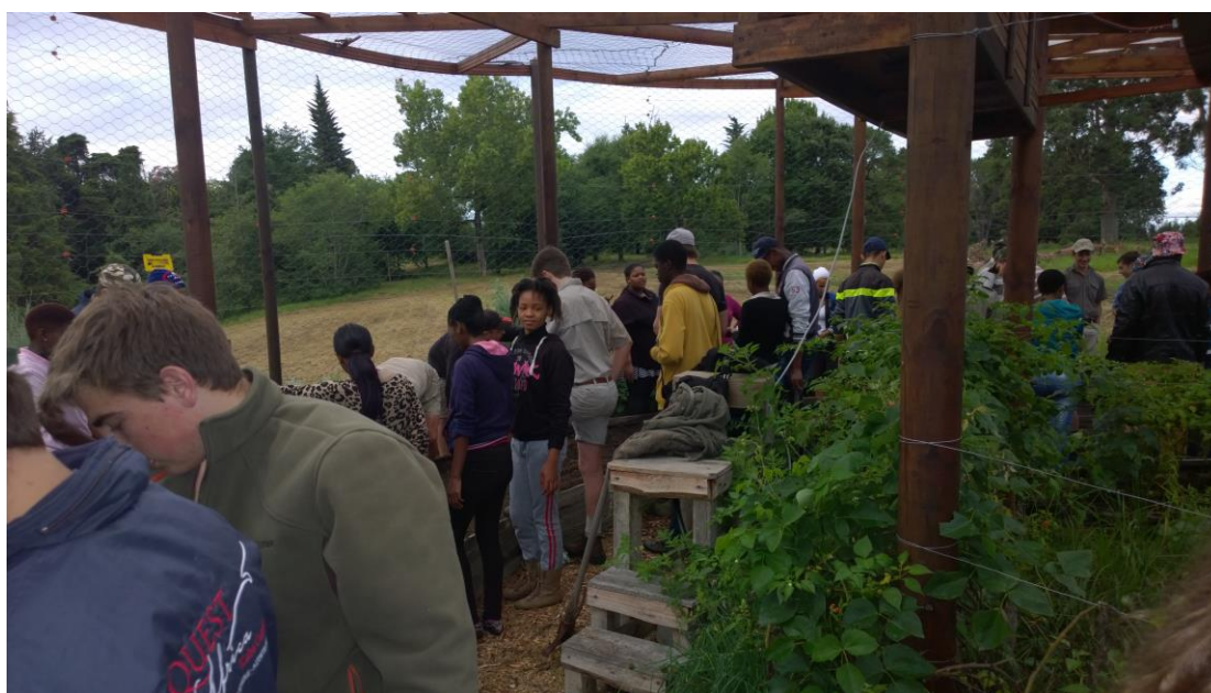
Students planting the gardens which they planned, using crop rotation and permaculture principles; Respect for the Environment is an NMMU value which we uphold