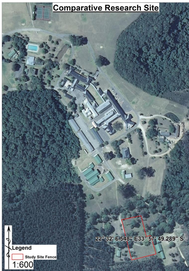
Figure 4: Land Use within the security-fenced research area (about 0.5 ha) on the NMMU George Campus at Saasveld; the new Permaculture Centre is between the site and the circle at the top right part of the short open strip of grass, adjacent to the forest on the right.